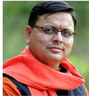
Shri Pushkar Singh Dhama